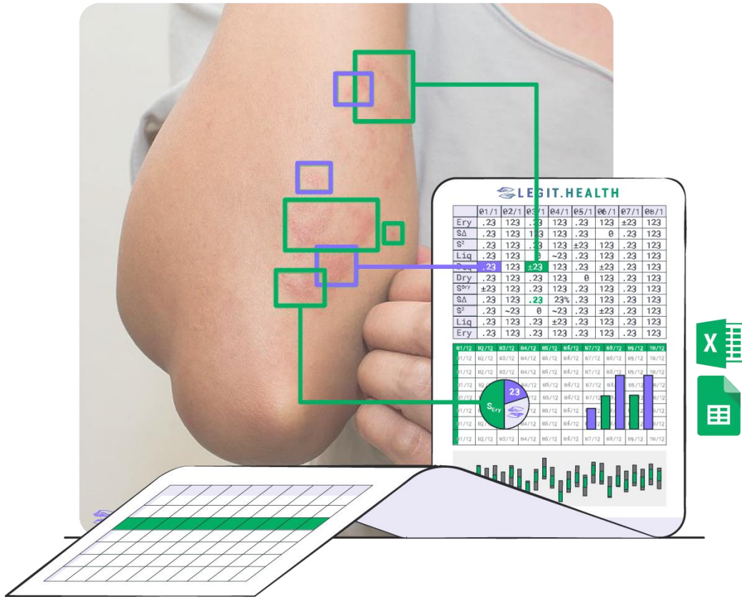
Link to this image: px2csv-alt.png